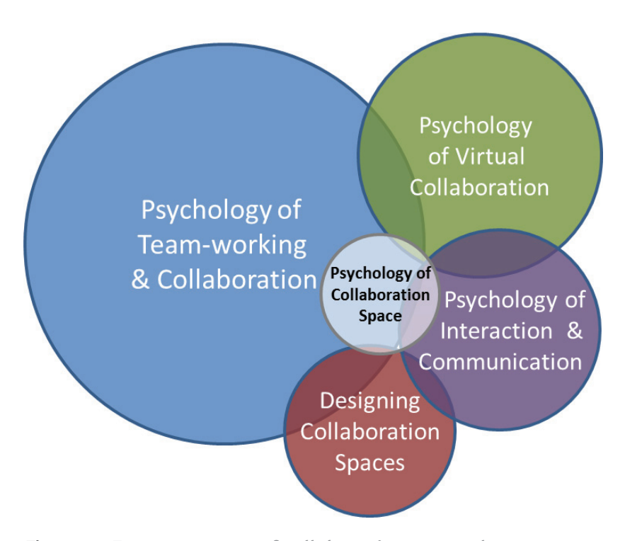
Figure 1. Four core areas of collaboration research

The literature review revealed that much of the research on the psychological aspects of collaboration focuses how to maximise the performance of teams. These studies examine the psychological profiles of team members and the best combination of them, or how to motivate and develop teams so they are performing to their maximum potential. Cohen & Bailey (1997) observed that "group effectiveness is a function of environmental factors, design factors, group processes and psychosocial traits". On first appearance this observation seems pertinent to designing collaboration space; however their "environmental factors" actually refer to the external economic market and their "design factors" refer to the features of the group that can be manipulated by managers to create the conditions for effective team performance.